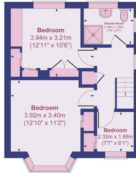
First Floor Floor area 40.1 sq.m. (432 sq.ft.) approx

Not to scale for layout reference only. All Measurements are Approximate Produced by As built Energy Surveys for Andrew Granger & Co orders@asbuillenergysurveys.co.uk